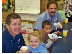
Purcell Early Learning Center